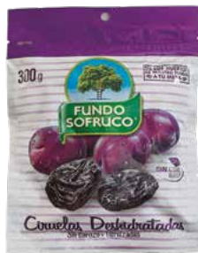
RETAIL BAG 300G