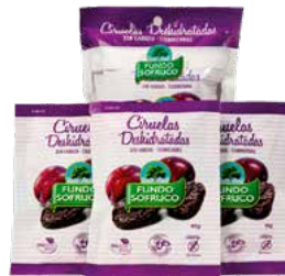
SNACK BAG 60G