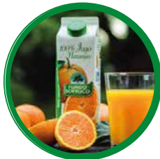
NFC 100% NATURAL JUICES