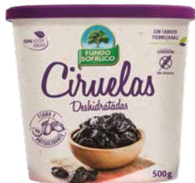
PAPER CAN 500G